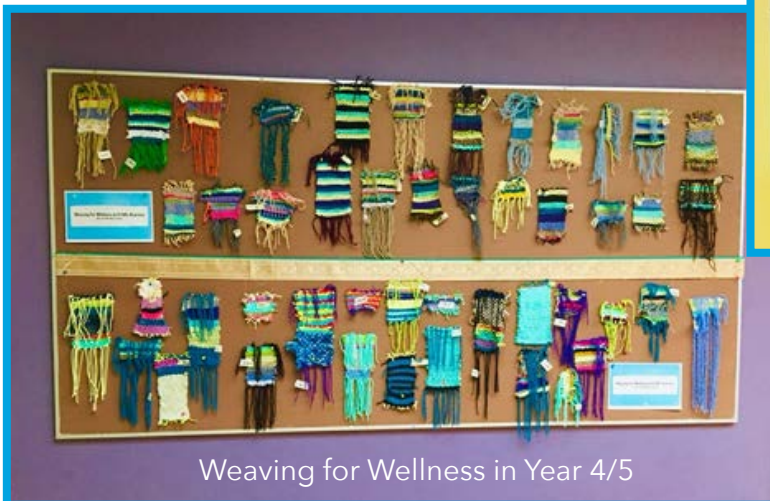
Weaving for Wellness in Year 4/5